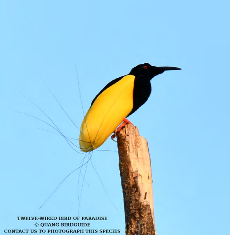
TWELVE-WIRED BIRD OF PARADISE CONTACT US TO PHOTOGRAPH THIS SPECIES

Other birds can be seen: Blue Jewel Babbler, Papuan Babbler, Victoria Crowned Pigeon, Bush Turkey, Northern Cassowary, Trillers, Cuckooshrikes, Little Shrikethrush, Black Coucal, Rusty Pitohui, Brush Cuckoo, Little Bronze Cuckoo, King Parrot, Buff-faced Pygmy Parrot, Salvadori's Fig Parrot, Double-eyes Fig Parrot, Crimson Finch, Cicadabird, Azure Kingfisher, Rufous-bellied Kookabura, Papuan Frogmouth, Papuan Boobook